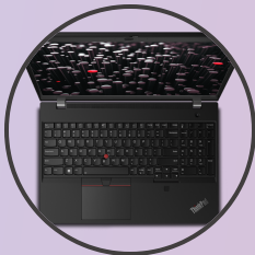
Keyboard with numeric pad