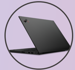
Power-on MoC Touch Fingerprint Reader

Powered by 12th Gen Intel Core Processor, this ThinkPad enables account representatives and store sales managers to simplify their work processes. WiFi 6E support ensures uninterrupted connectivity and faster upload and download. Security solutions like optional camera privacy shutter and optional touch style fingerprint reader protect user privacy and ensure only the device owner logs in.