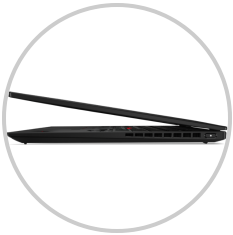
Features an improved ergonomic design

This device is strikingly thin, weighs under 1kg (99.5 g) and serves as perfect fit for mobile retail professionals. Supercharged with 13th Gen Intel Core i7 processors and Intel Iris XE graphics, apparel and e-commerce teams can get all their tasks done with optimized speed and efficiency. With up to 1TB SSD, this device lets product merchandisers launch apps, documents and merchandise data - all in a flash. Its 49.5Wh battery supports rapid charge and lasts up to 11.13 hours.