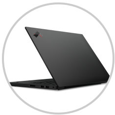
Power-on MoC Touch Fingerprint Reader

Built for today's on-the-move professionals, the laptop – powered by 12th Gen Intel Core Processor – delivers speedy performance no matter how intensive the task. WiFi 6E support enables fast and reliable mobile connectivity and helps transfer huge volume of data at a lightning-fast speed, even in a device-crowded network. Plus, battery life of up to 9-hours gives users the flexibility to work an entire day outdoors, without needing to charge the device.