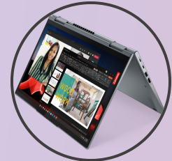
Convertible with 360-degree hinge

Powered by up to 13th Gen Intel U or P Series Core i7 Processor, this laptop combines productivity and lightweight design – ideal for professionals who demand optimal performance while they are on the move. Support of Wi-Fi 6E ensures a high-speed and reliable connected experience helping users to work from anywhere, even in a device-crowded network. With a 57Wh battery that supports rapid charge, the laptop gives the power to keep rolling through your workday.