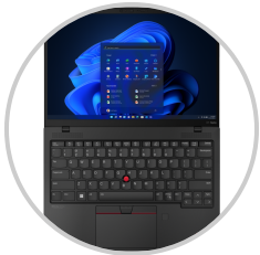
Features an improved ergonomic design

Blending performance with portability, this 13" laptop is the perfect partner for professionals who are always on the go. Productivity boosting features such as up to 1TB SSD storage and up to 32GB memory make the device ideal for modern professionals working from anywhere. Smart security features like match-on-chip touch style fingerprint reader, optional Vision-based User Presence and built-in ThinkShield security, help secure device and data against any evolving threats.