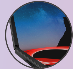
16.3" innovative foldable OLED display