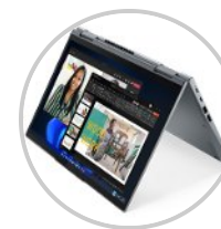
Elegant Convertible, Mobile Companion.

This redesigned, elegant business convertible is perfect for store managers or marketers. Though thin and light, it's a powerhouse of productivity-enhancing features, including Intel Iris Xe graphics, 12th Gen Intel Core processors, and up to 2TB ultra-fast SSD storage – means quicker load times of large files and complex data or applications, even on-the-move. In-store sales professionals can convert it into different modes – laptop, tablet, tent, and stand – and discuss products and features with customers conveniently.