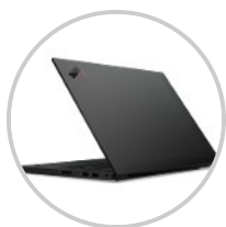
Power-on MoC Touch Fingerprint Reader

Powered by 12th Gen Intel Core Processor, this ThinkPad enables account representatives and store sales managers to simplify their work processes. WiFi 6E support ensures uninterrupted connectivity and faster upload and download. Security solutions like optional camera privacy shutter and optional touch style fingerprint reader protect user privacy and ensure only the device owner logs in.