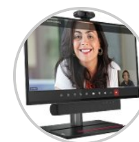
4K RGB-IR detachable camera