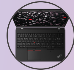
Keyboard with numeric pad