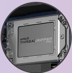
AMD Threadripper PRO processor