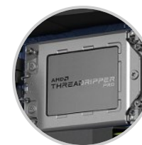
AMD Threadripper PRO processor