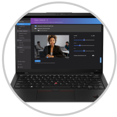
Power-on Touch Fingerprint Reader

This redesigned laptop is a powerhouse of performance-boosting features, and yet comes in an ultrathin and ultralight form factor – ideal for new-gen retail professionals. Powered by up to 13th Gen Intel Core processor and up to 2TB SSD storage, it delivers superior and a swifter computing experience while working on heavy-duty applications or complex data and files. Comprehensive security features ensure maximum data and device safety.